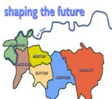
The South London CVS Partnership

Richmond - host the 8th annual community awards ceremony, blooming marvellous , on 11th November at Kew Gardens. Call 020 8255 8163 for more information.